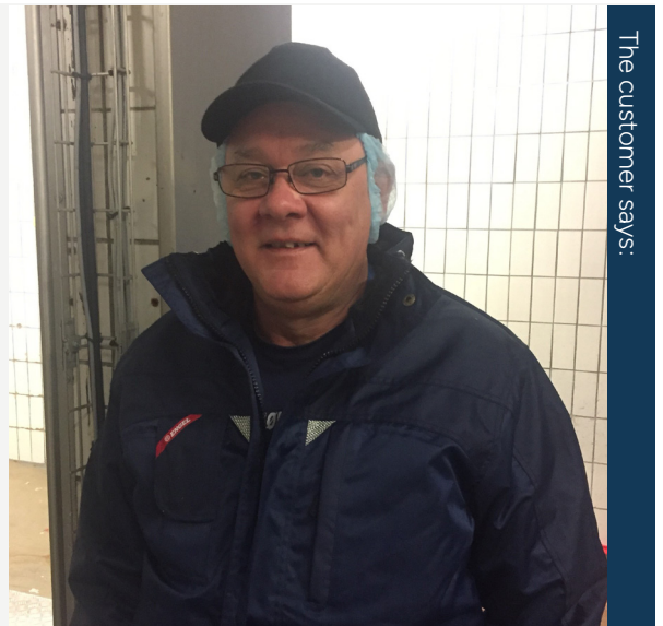
The customer says:

– Project management went seamlessly, and we experienced a very professional approach, quick delivery and a very good cooperation towards the optimal solution.